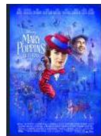
Mary Poppins (PG) 2h10min