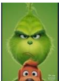
Grinch (G) 1h45min