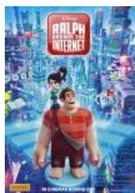
Ralph Breaks the Internet (PG) 1h54min